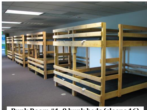
Bunk Room #1: 8 bunk beds (sleeps 16)

Volcano Outdoor School participants will either sleep on the floor amidst former visitor center displays or in one of our two bunk rooms. Our two bunkrooms (with a total of 26 total beds), as well as numerous large rooms, accommodate separate male and female sleeping arrangements. Nine (9) cots are available to increase the sleeping capacity of either bunkroom; an additional 2 people may sleep on a cot or on the floor in bunkroom #1 for a total capacity of 18. For groups larger than 35 people, please come prepared with supplies to make sleeping on the floor comfortable and enjoyable. For large groups, visitors may sleep in cots or on the floor in the hallways/rooms adjacent to either bunkroom. There are centrally located bathrooms with hot water but there are no showers.